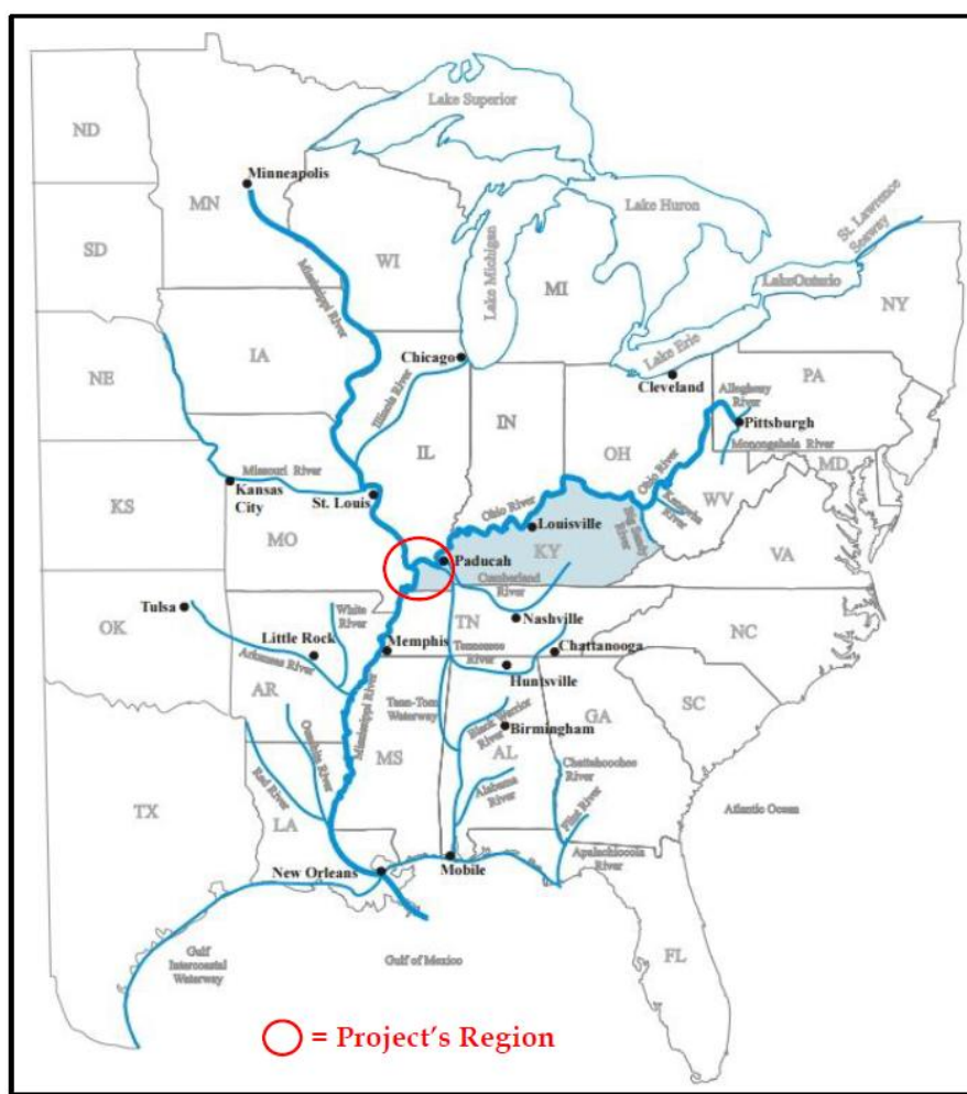
Figure 1: Project Location

This RFP’s Scope includes, but is not limited to, (1) identify and evaluate potential Project sites within Ballard, Carlisle, Hickman, and Fulton Counties, to include consideration of a previously identified site, (2) assess customer demand, (3) prepare conceptual layout for shortlisted site(s), (4) identify required regulatory approvals and processes, (5) evaluate potential rail and highway connections and identify necessary improvements, (6) recommend deal structure, and (7) develop stakeholder engagement and community outreach plan. WKRRRA will give preference to proposals that incorporate port operator expertise and experience.